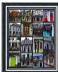
Cover photo: "Doors of New Orleans" New Orleans, LA