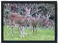
COVER PHOTO- "Doe, a deer" (Runnemede, NJ)